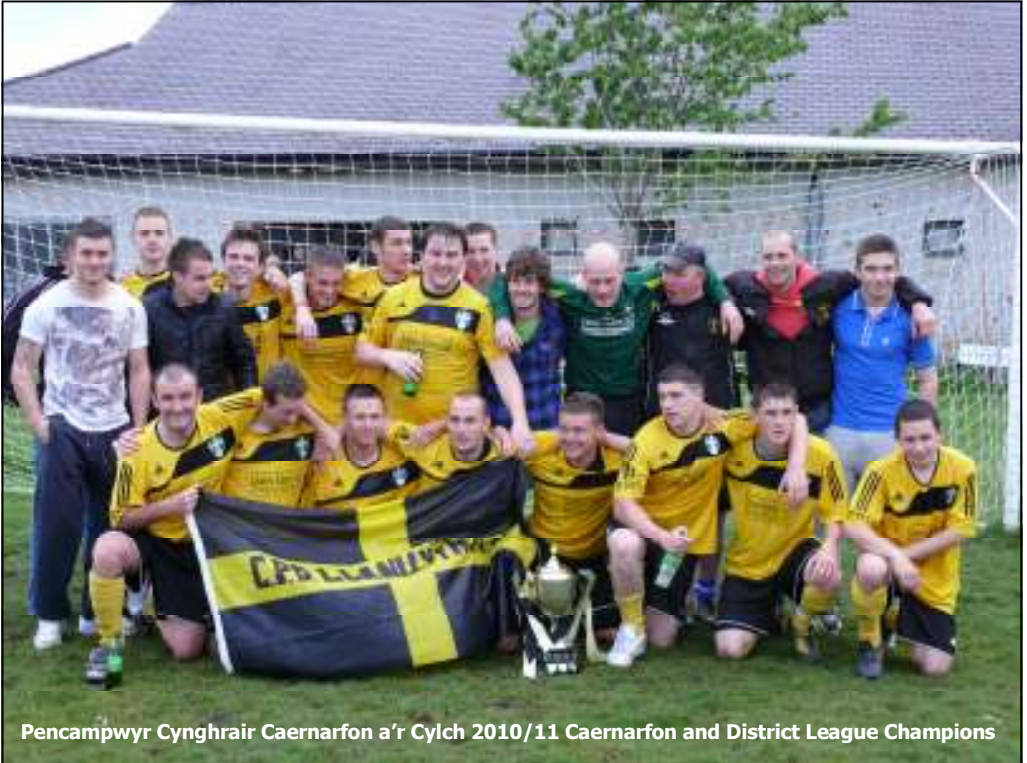
Pencampwyr Cynghair Caernarfon a'r Cylch 2010/11 Caernarfon and District League Champions

Sadwrn 3ydd o Fedi 2011 / Saturday 3rd of September 2011 14:30ko