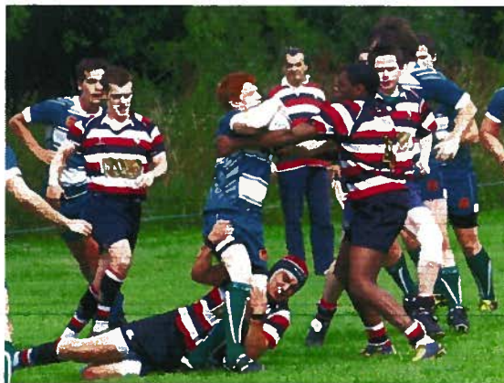
Action from the Senior Colts game

The Senior Colts kicked off there season with a somewhat depleted squad, but put up a spirited performance before going down to Trentham. The Junior Colts also lost their first league game away at Broughton Park.