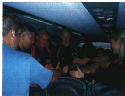
Coach trip back from Penrith