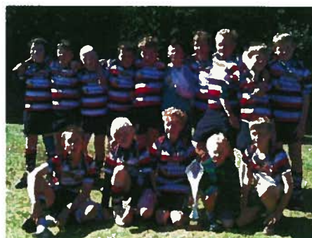
Southport Festival winners AK Under 7s, 8s & 11