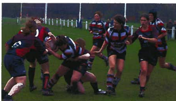
Action from the last Women's game of the season