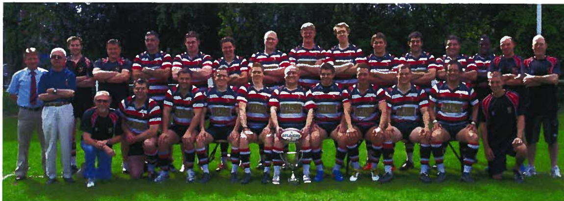
AK 1st Team with the North One League Trophy