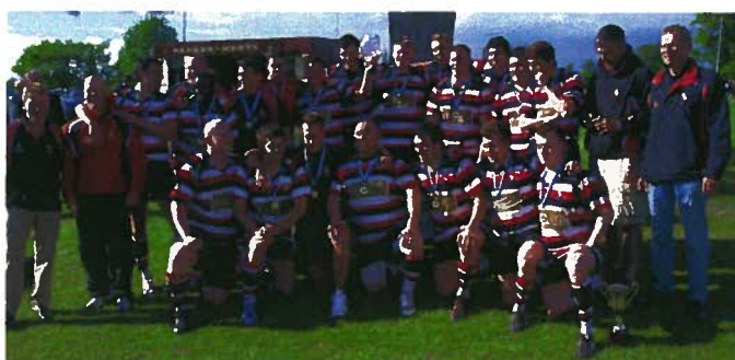
AK celebrate with the Cheshire Vase