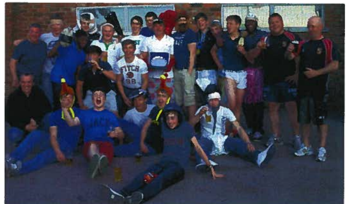
AK Junior Colts 'celebrate' with the Cheshire Plate