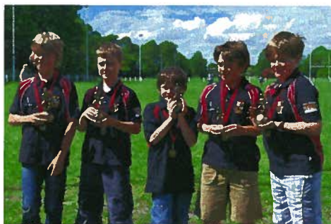
AK Under 10 award winners