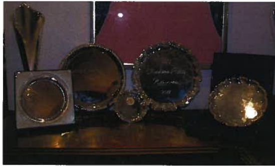
A selection of the Mini/Junior trophies won