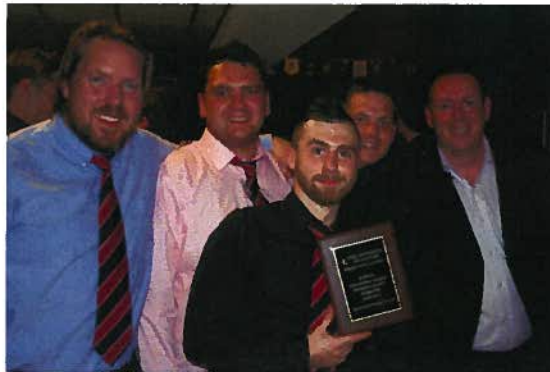
AK 3 rd Team with their runners up plaque

AK 3 rd Team: Division 4 South Runners Up and promoted.