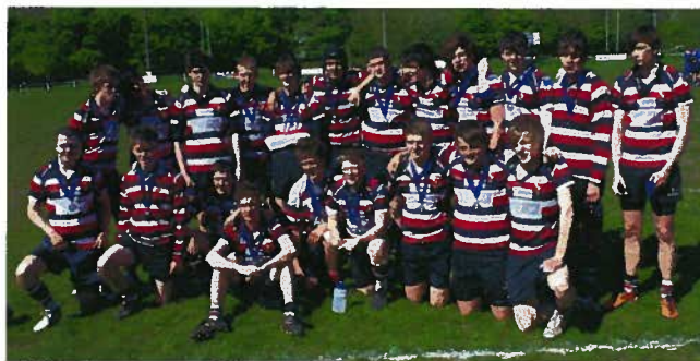
AK Under 16s after their Cheshire Vase Final