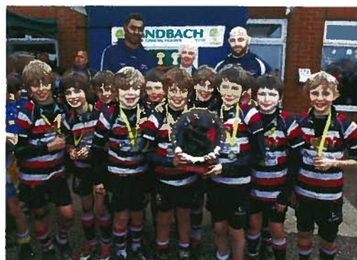
Cheshire Plate Winners AK Under 9s & 10s