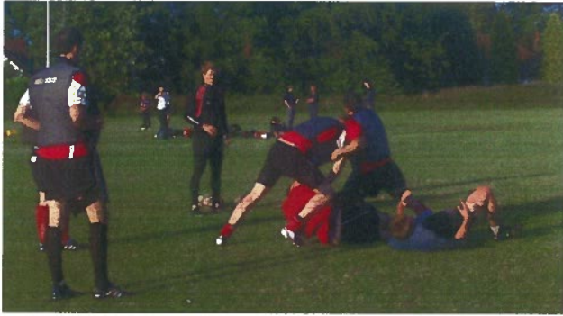
Full contact at training

The AK 1 st Team start their season in National League 3 North away to Penrith on Saturday 3 rd September. This will be a coach trip leaving AK at 11.00 and all support on the day will be welcome as the lads kick off their season with this tough away trip. The AK 2 nd and 3 rd Teams are at home that day to Burnage 2s and Bowdon 2s respectively. All fixtures for the new season in respect of the senior men's & women's teams are now shown on the AK Website