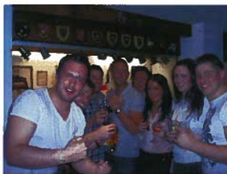
Players actually brought their g/f's along.