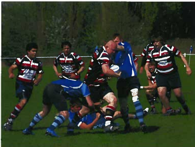
Action from last Sunday's Senior Colts Cheshire Cup Semi Final

The Senior Colts also beat Winnington Park last Sunday to go through to the Cheshire Cup Final on 1 st May against Caldy. AK Senior Colts have won this competition for the last 3 years, so it is great to see AK in the final again.