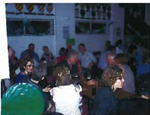
Good turn out at the Irish night

A very successful night organised by the AK Under 12s with a good turnout from all parts of the club. Lots of 'putting it when you should have been pulling out' so to speak, especially once the beer started to take effect!