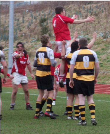
Warriors and Bumbles in Llanelli, Feb 2011

Warriors "gutted" to miss out on summer International.