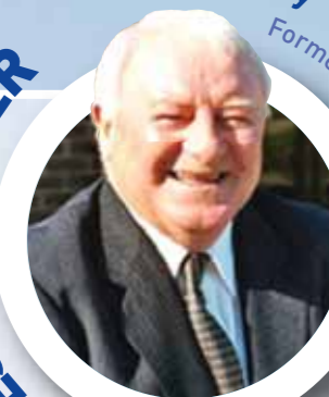
Tommy 'THE DOC' Docherty Former Manchester United Manager