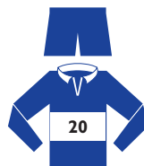
A Cotton & S Cassells