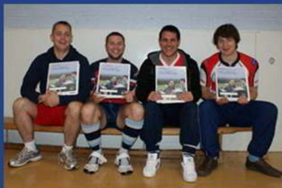
Growing Our Own: Four players complete the RFL level two coaching badge.