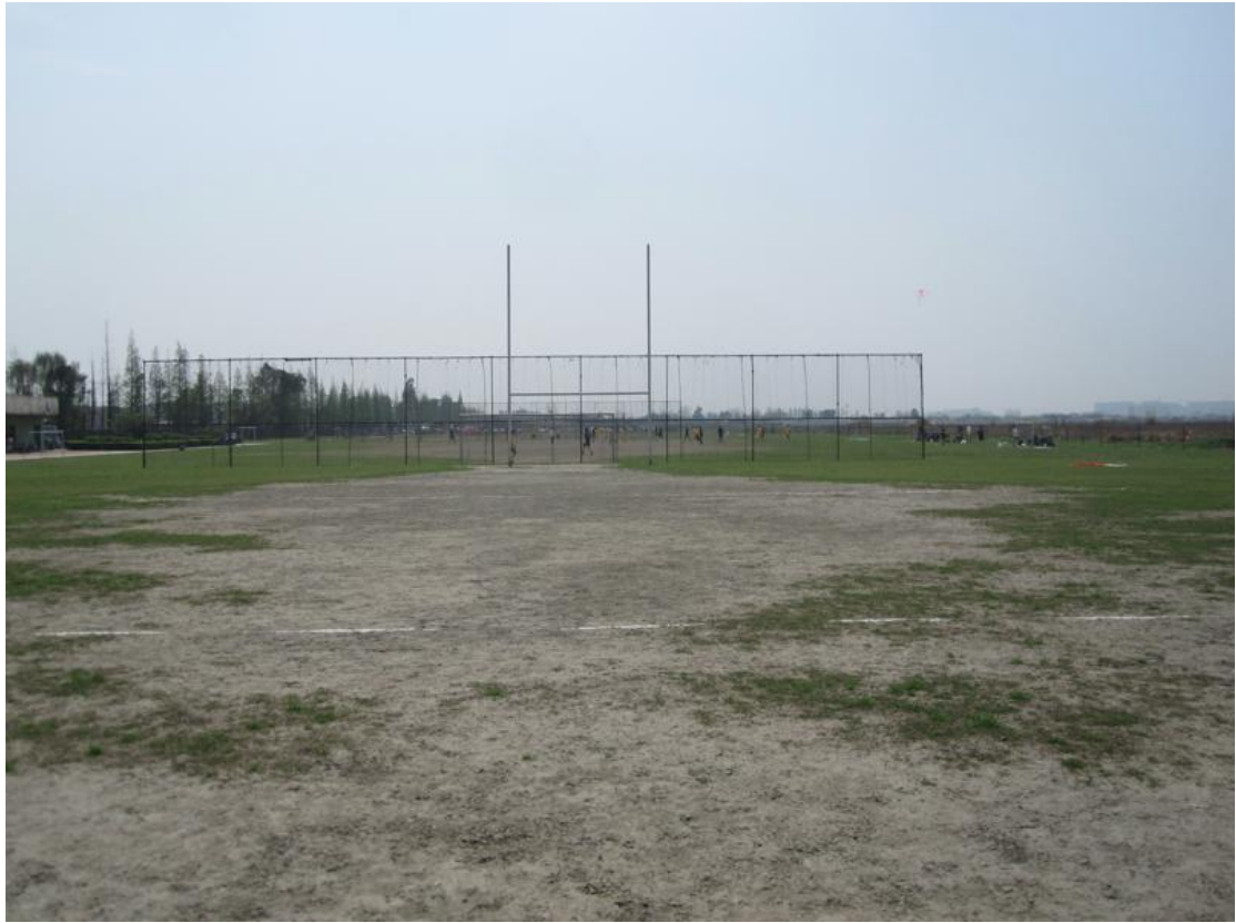
The "concrete" pitch in Chengdu