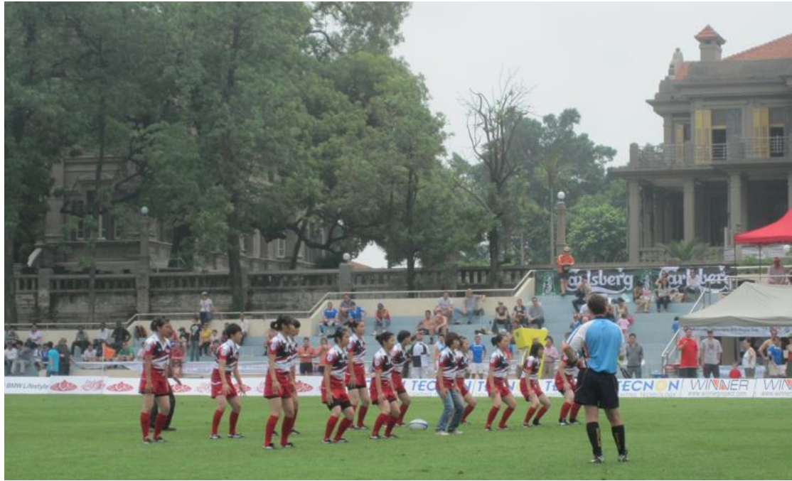
One of the many Chinese ladies teams doing their version of the Haka