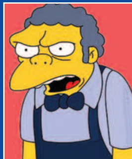
Barman 7 out of 10